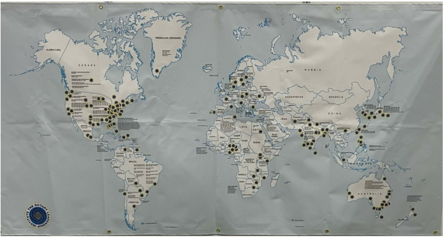
The Rotary Leadership Institute is not an official training program of Rotary International.